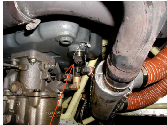
Sensor shown installed in a Lycoming O360-A1A